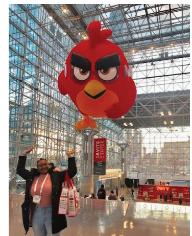
Angry Birds take over the Javits Center.