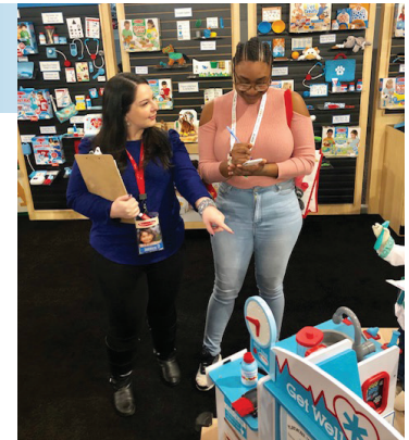
Getting the rundown on the newest toys.

If you're interested in supporting our youth employment programs, email CCC@TheGuidanceCenter.org